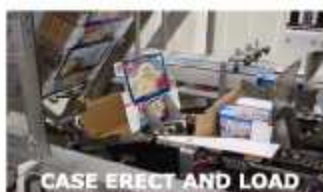
CASE ERECT AND LOAD