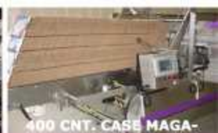
400 CNT. CASE MAGAZINE